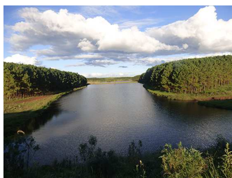
Foto 3 y 4: Pacú de cultivo tamaño comercial y estanques de cultivo en la provincia de Misiones.