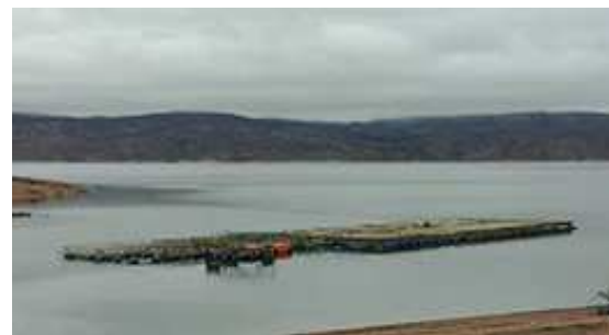
Foto 1 y 2: trucha de cultivo y jaulas de cultivo en embalse.